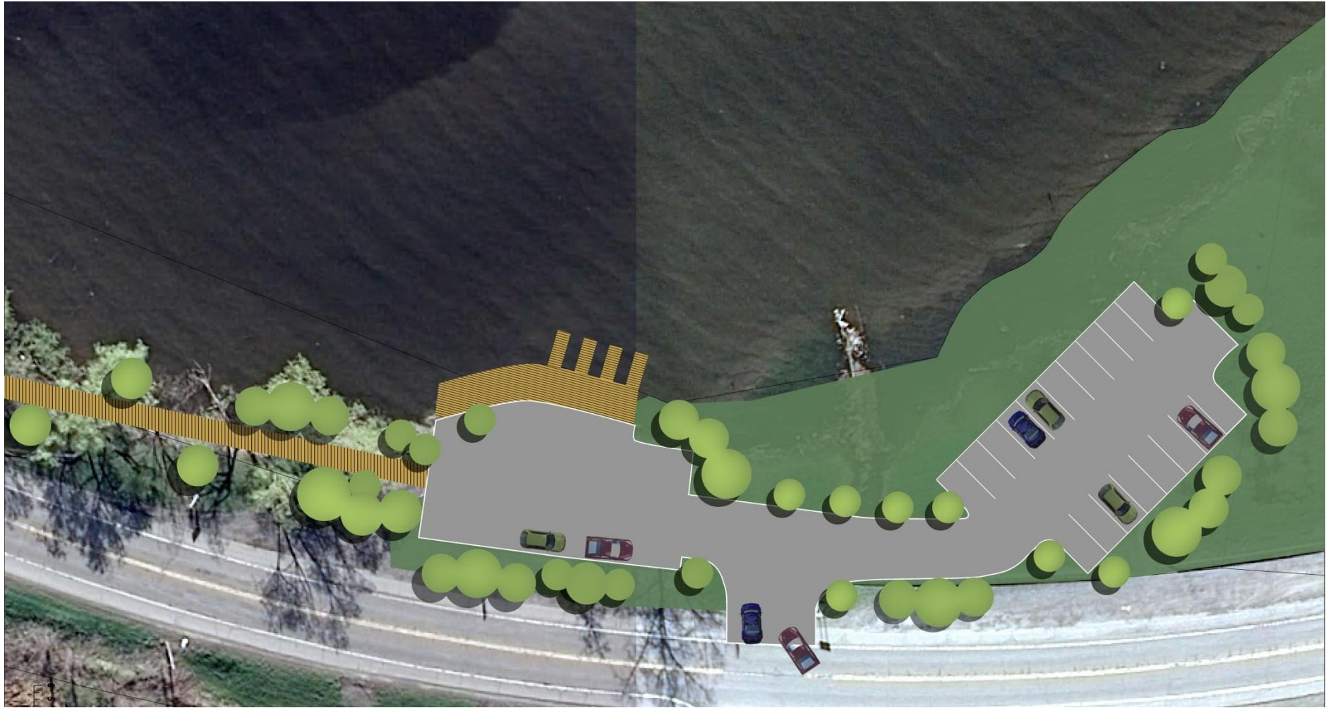
created by: schuyler county planning department